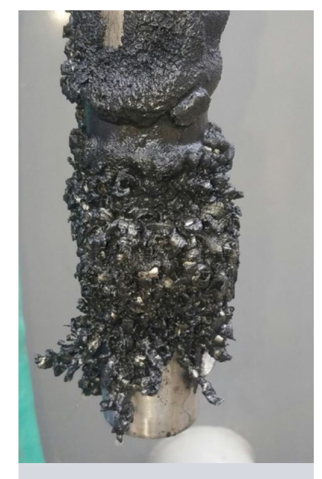
Contamination captured after 18 hours in a desalter water test.