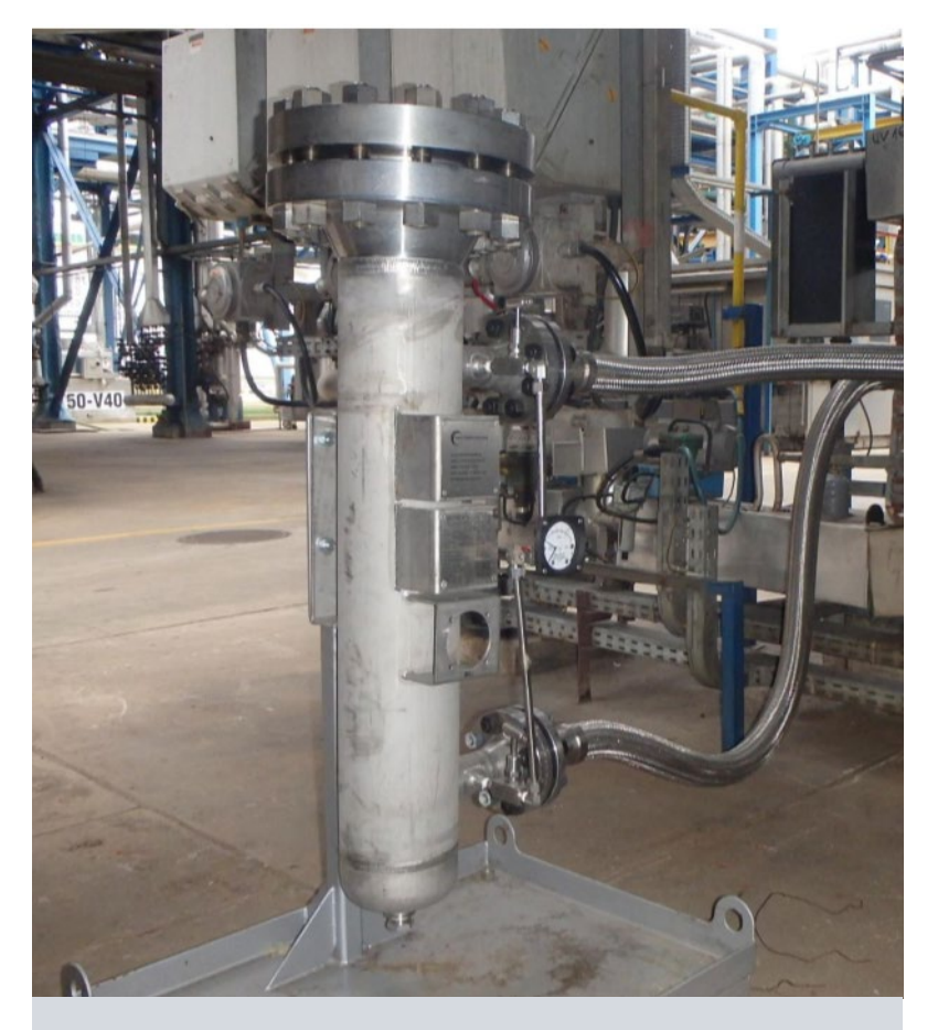
BPS magnetic separator installed in the fuel gas system of the hydrocracker complex.

BPS provided a test magnetic separator to the refinery along with flexible steel hoses for plug-and-play testing purposes.