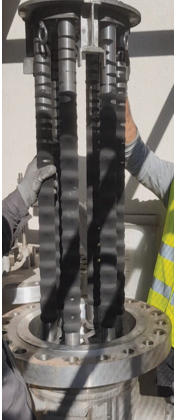
Figure 2. Removing the magnetic array from the magnetic separator for initial cleaning.

The traditional filters positioned downstream of the BPS magnetic separator are void of any contamination, indicating that ~100% of the black powder was captured by the magnetic separator. In 2015, the utility's Technical Director stated "Your separator is performing great... we have a depth media filter downstream of the magnetic separator that has been perfectly clean [so] we trust your solution." As shown in Figure 2 from 2018, the magnetic array is being removed from the magnetic separator housing to be cleaned and then re-installed for use. As of late 2020, the utility confirmed that the magnetic separator system continues to operate with the same high efficiency as it did in 2014.